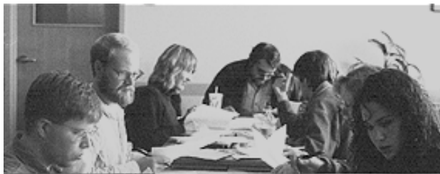
PADM 624 Students engaged in a group task.

Want all the hot news and information on upcoming events, job opportunities, or internships? Then subscribe to the MPA Mailserv. Simply send an email message to mailserv@uaa.alaska.edu . The message should state "subscribe uaampa insert your email address here. " We are currently updating our Website. The new URL link will be: http://gaius.cbpp.uaa.alaska.edu/mpa/