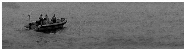
Mapping positions of shipwrecks using GPS.